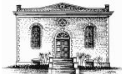
The Adams Street Synagogue